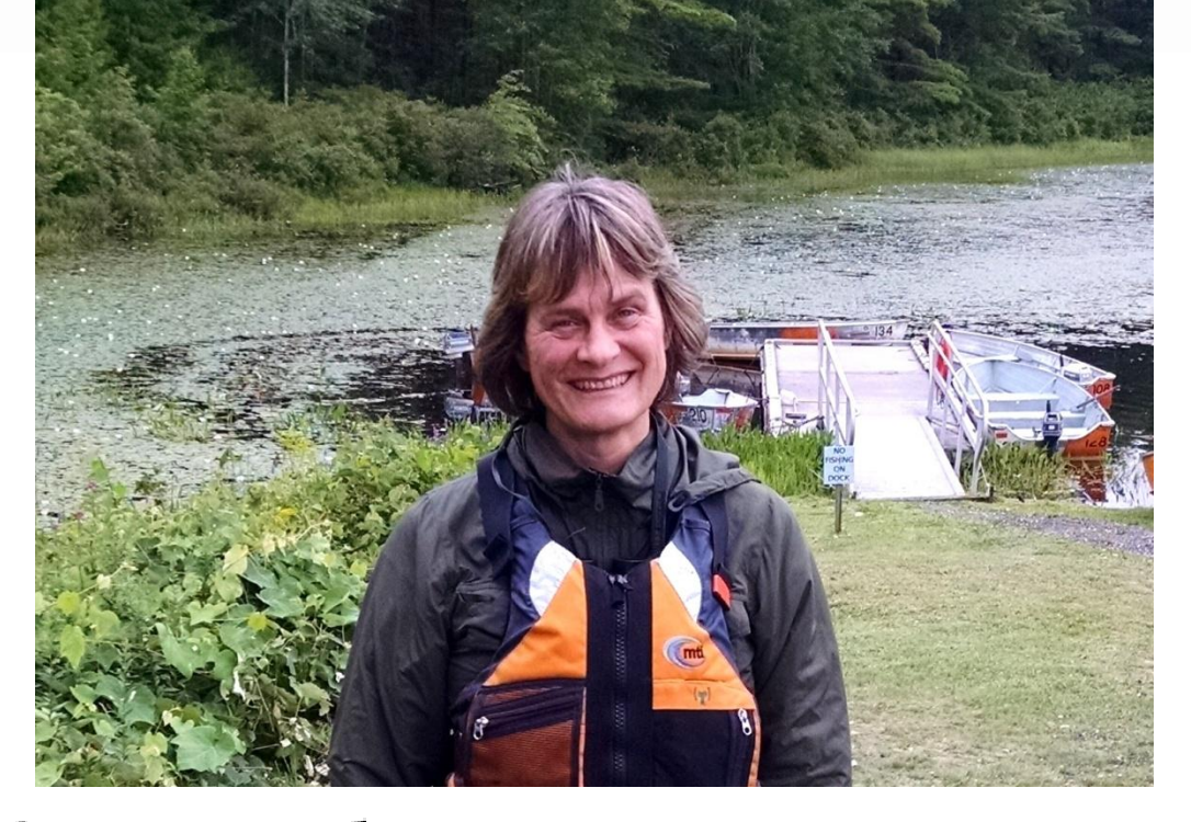
Universal Access Program