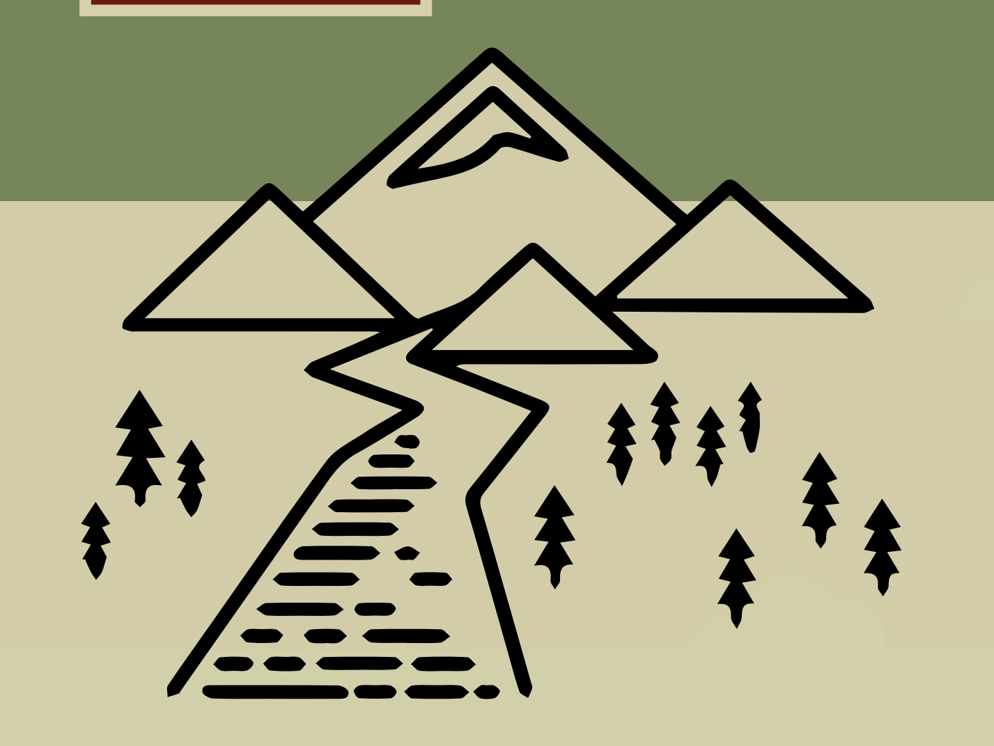
Facing Challenges Together