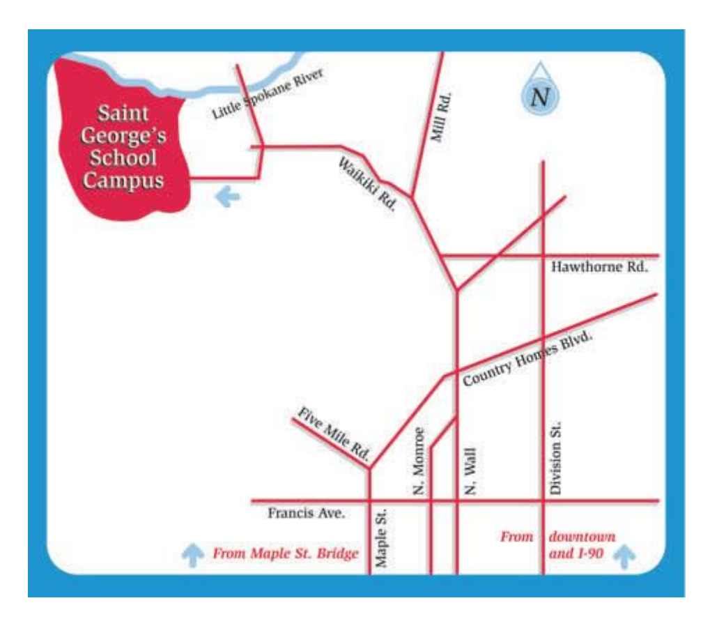
Map to Saint George's School campus

While continuing to stay in the left lane, follow Waikiki down a long hill, and at the bottom of this hill, you will come to a roundabout. Take your second right to stay on Waikiki. (If you find yourself on Mill Road, turn around and head south until you can get back to Waikiki.) Follow Waikiki past the Spokane Country Club (on your right), the road winds down past the golf course and approximately ¾ mile beyond the entrance to the Club sign is the entrance to the school. You will come upon a red Saint George's School sign. Turn and bear left of the fork in the driveway. If you find yourself at the Fish Hatchery, head out and turn right at the Hatchery gate.) You are now on the Saint George's School Road. This is approximately ½ mile long. Drive through the gate. On your right are the Upper School and Middle School. You may park in the Visitors Parking—across the bridge, in the dirt parking lots.